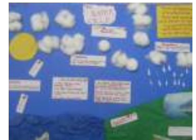
Water Cycle Diagram